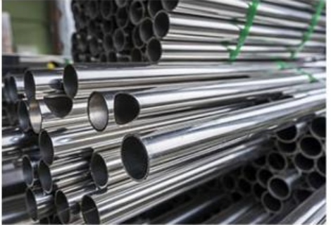
Using modern steelmaking technology, stainless steel can be cut, machined, fabricated, welded and formed like traditional steel, so it is easy to manufacture

The non-porous surface coupled with the easy cleaning ability of stainless steel makes it the first choice for applications requiring strict hygiene controls, such as hospitals, kitchens and other food processing plants.